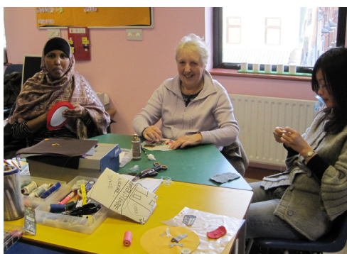
Women enjoying the activities at Falls Women's Centre.

Falls' Live and Learn project focuses on “promoting social inclusion of ethnic minority women”. Activities at the centre this year included: Lipstick & Money, Cookery & Food Hygiene, Intro to Computers, Driving Theory, Jewellery Making and Arts & Crafts. The following is an example of the life changing impact of one of the women at Falls.