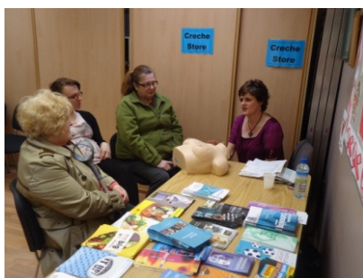
Women who participated in the Health Pamper Day.

Strathfoyle and FWIN Live & Learn projects both have a focus on “support to improve mental health”. Strathfoyle Women's Activity Group in association with Foyle Women's Information Network held a Health Pamper Day on 6 th April 2010.