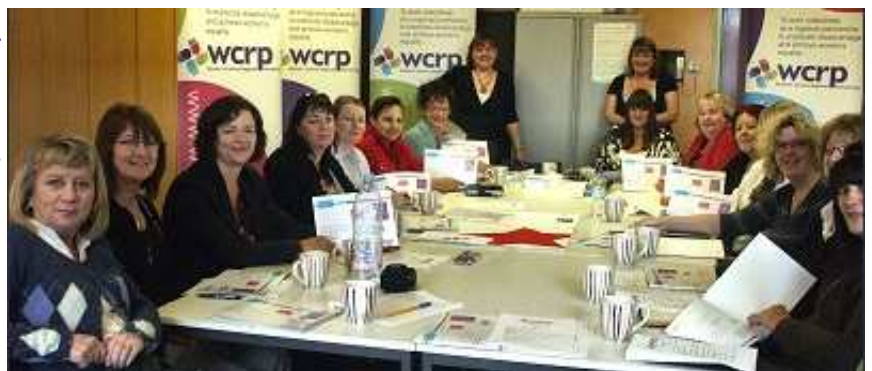
Launch of the Women's Training Prospectus in Shankill Women's Centre

The WCRP network meeting held in Shankill Women's Centre on 18th of September provided an opportunity for all of the groups to share information on their recent work and developments. At this meeting the first community based Women's Training prospectus was launched. This prospectus details the range of courses, education programmes and learning opportunities that are available throughout the 18 organisations profiled in the document. This is the first time that the women's organisations